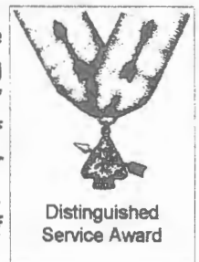
Distinguished Service Award